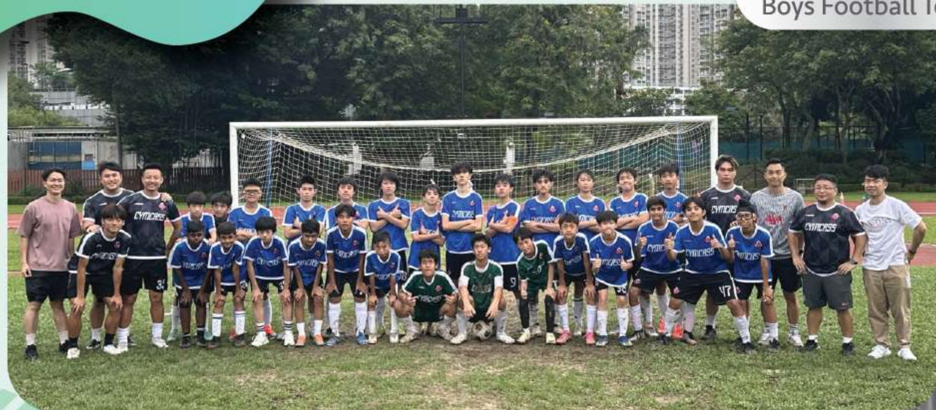
Boys Football Team