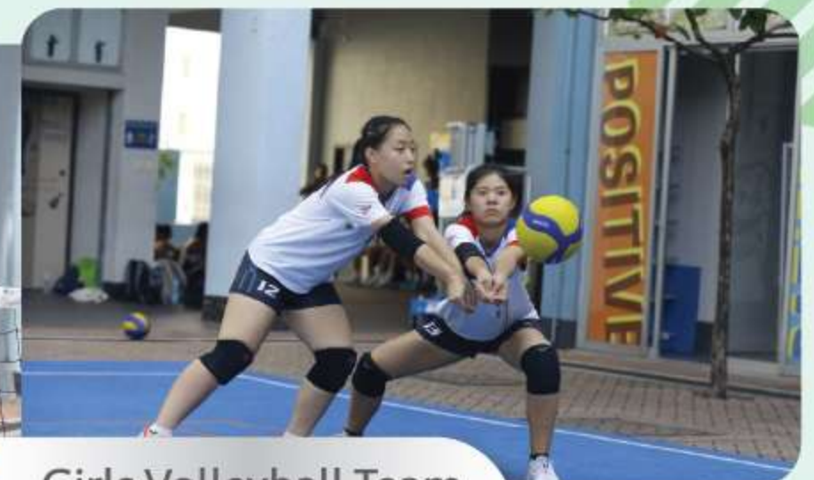
Girls Volleyball Team