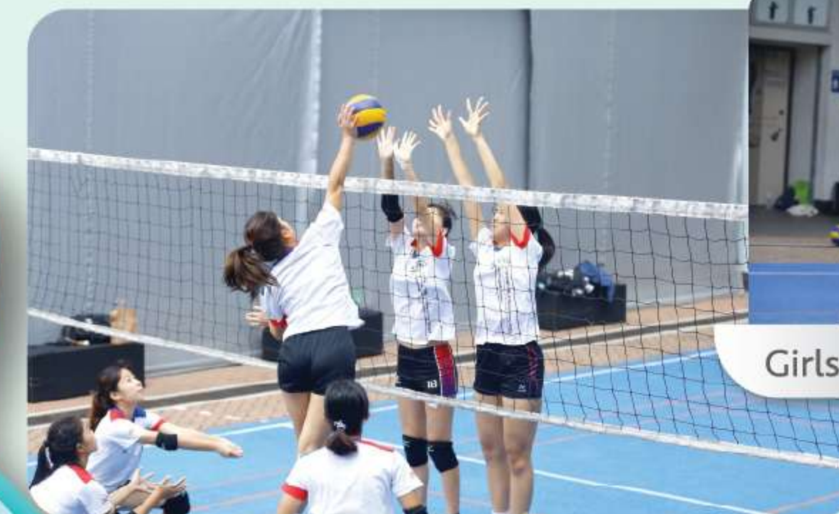
Girls Volleyball Team