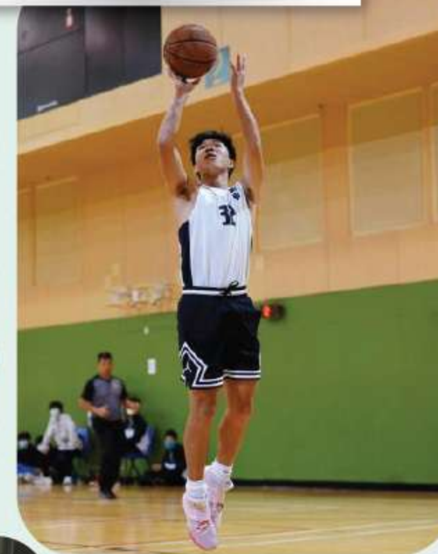
Boys Basketball Team