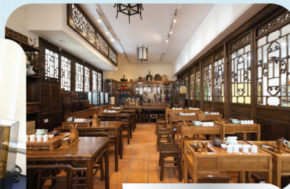
Chinese Cultural Centre