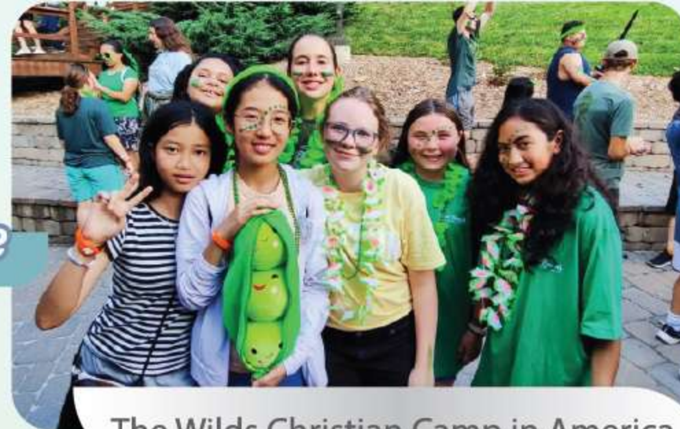
The Wilds Christian Camp in America