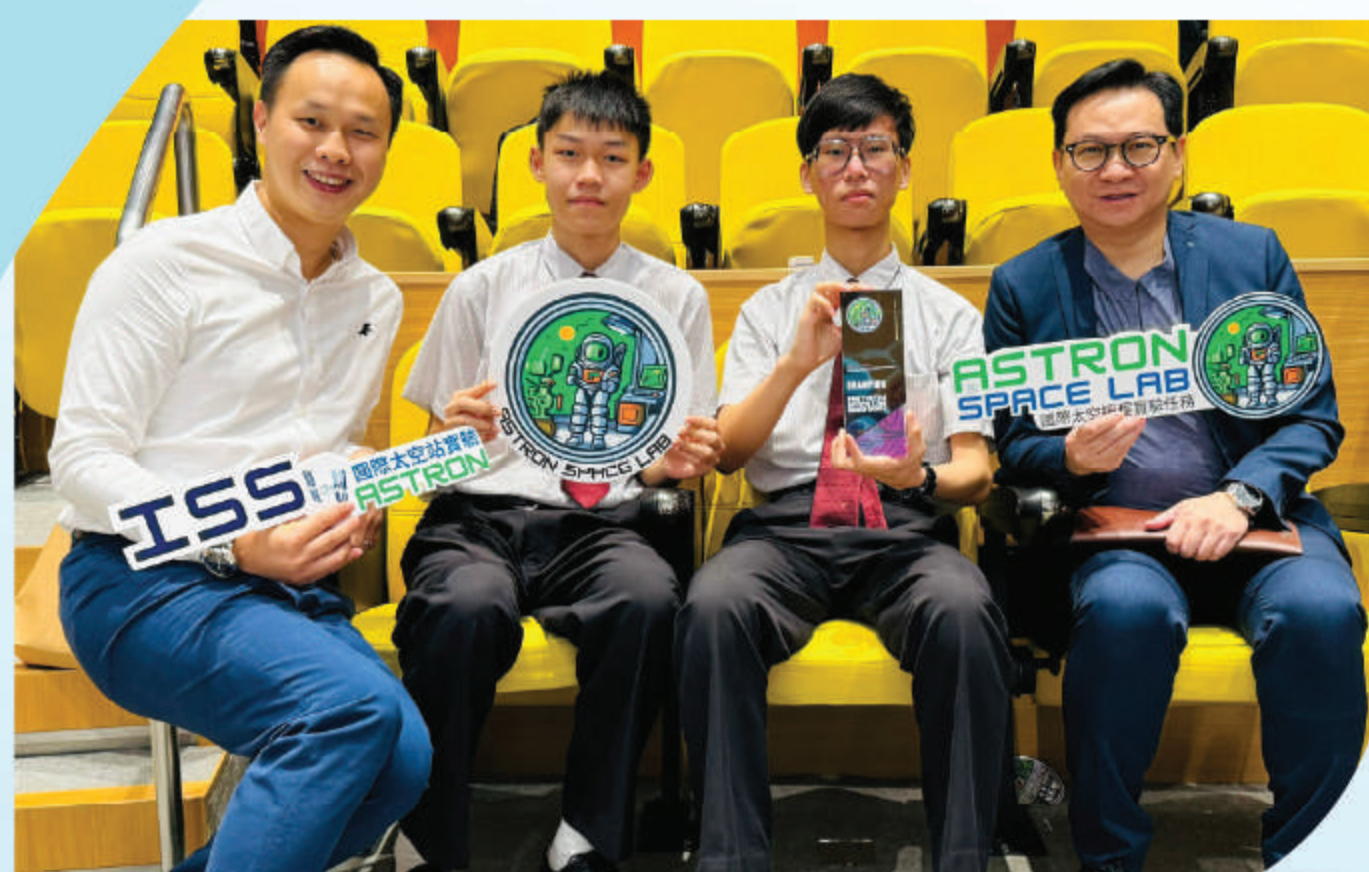
Grand Award in the "ASTRON SPACE LAB 2023/2024"