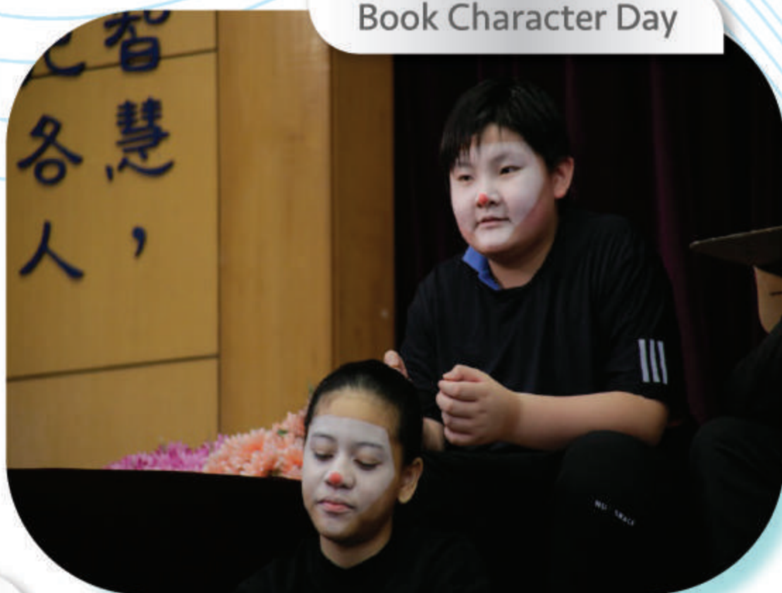
Book Character Day