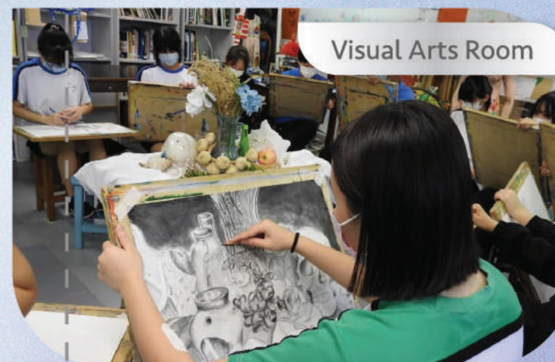
Visual Arts Room