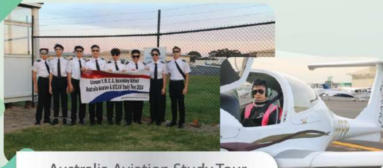
Australia Aviation Study Tour