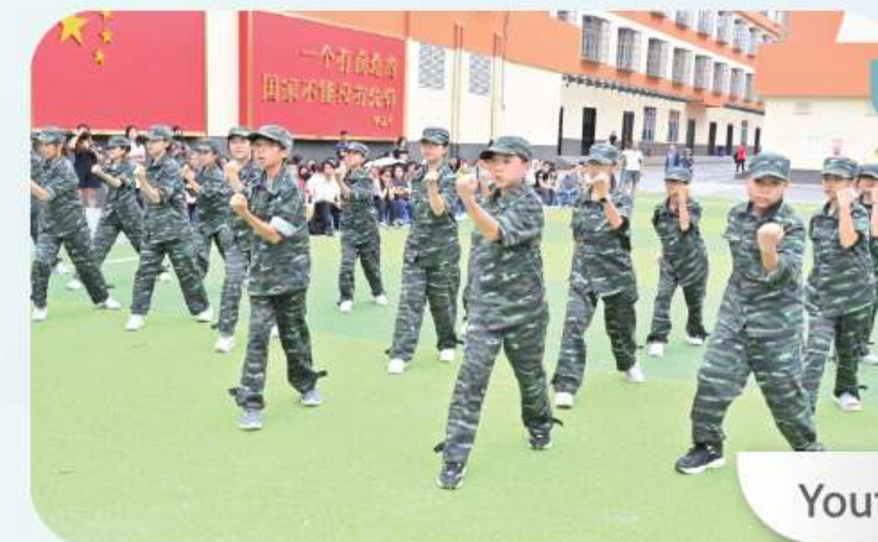
Youth Pioneer Training Camp