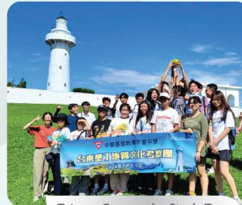
Taiwan Geography Study Tour