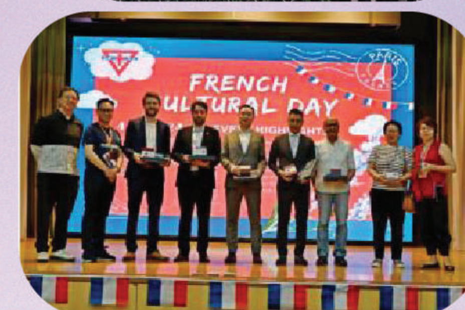
French Cultural Day