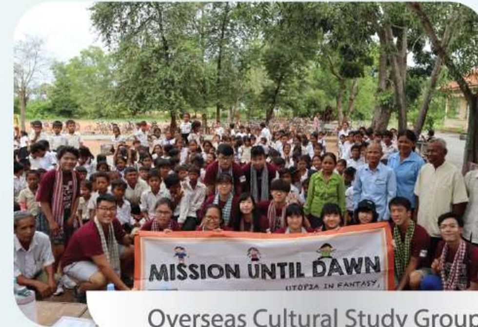
Overseas Cultural Study Group