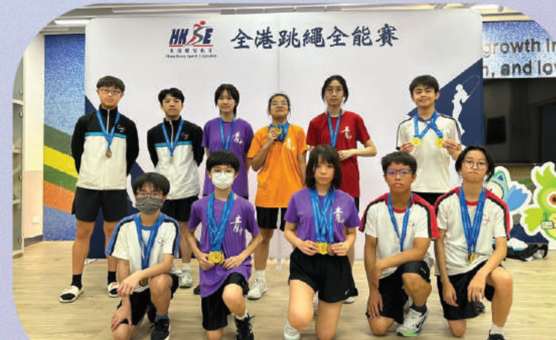
Rope Skipping Tournament