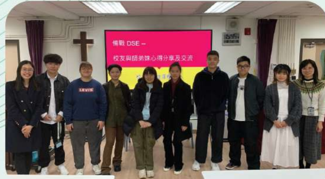
Graduates Share Examination Strategies and Experiences to Walk with Junior Schoolmates

The “Career Advice Mentorship” programme arranges all secondary five students to meet and share with Chinese Y.M.C.A. Secondary School alumni. In these casual meetings, our alumni share their interests and experiences in life and at work with students; thereby encouraging mentees to explore directions they will take in life and to prepare themselves for their future careers.