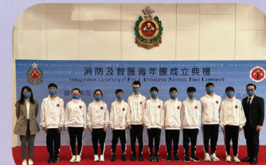
Fire & Ambulance Services Teen Connect