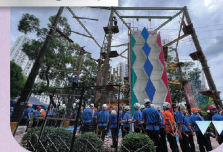
Adventure Training Camp