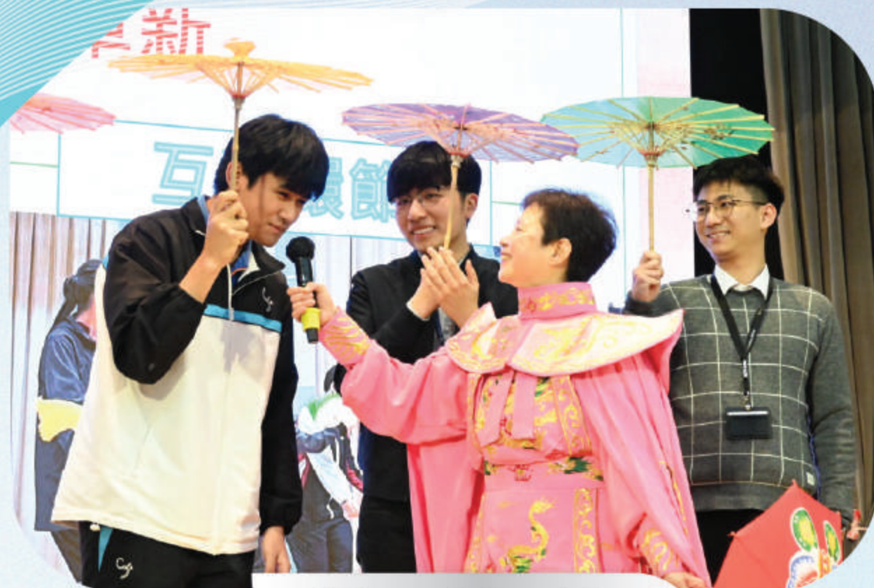
Chinese Cultural Days