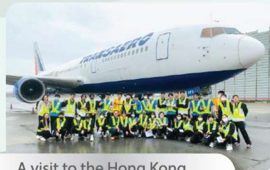
A visit to the Hong Kong International Aviation Academy