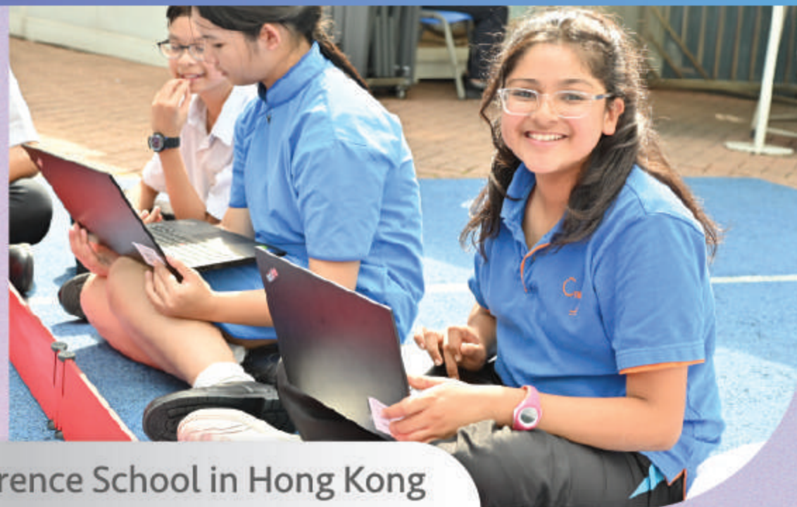
2018 The first Google Reference School in Hong Kong