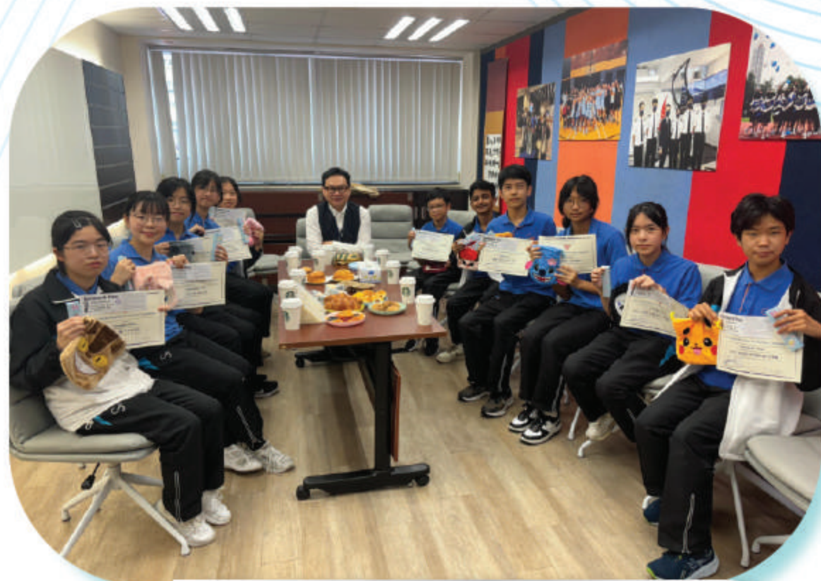
Reading Promotion Competition