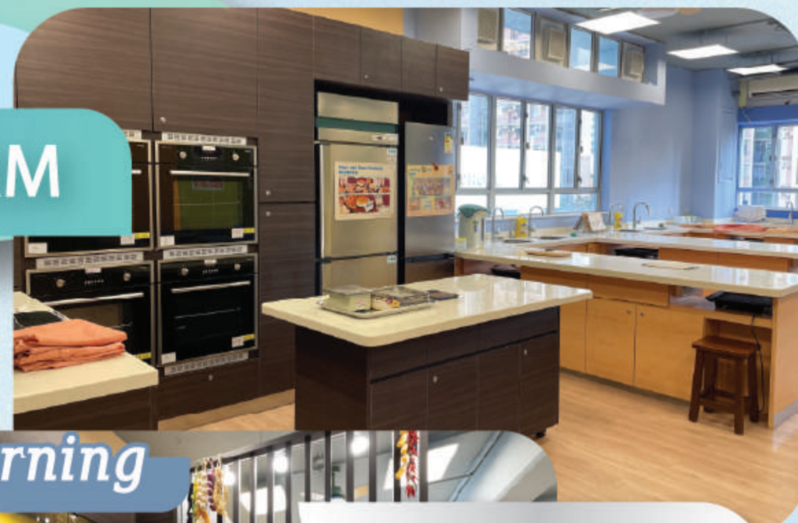
Home Economics Room