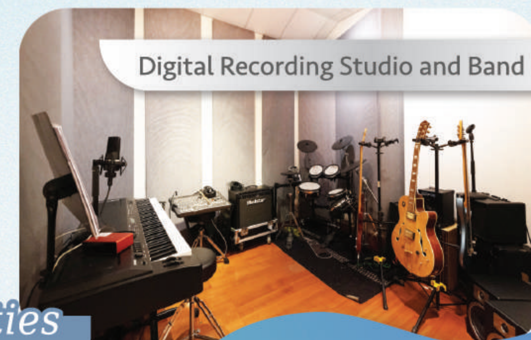
Digital Recording Studio and Band Room