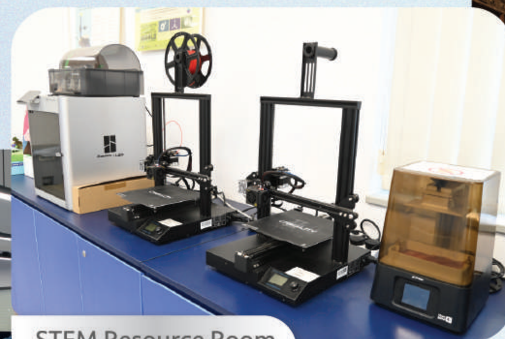
STEM Resource Room