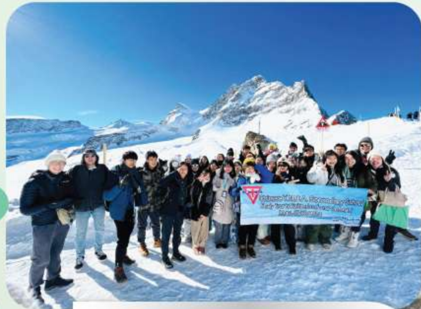
Overseas Exchange Tour