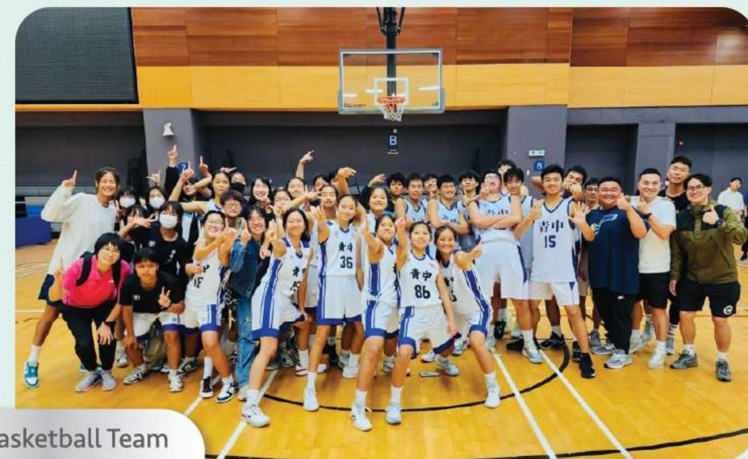
Girls Basketball Team