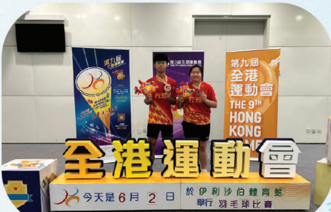
HKSSF Yuen Long Secondary Schools Area Committee