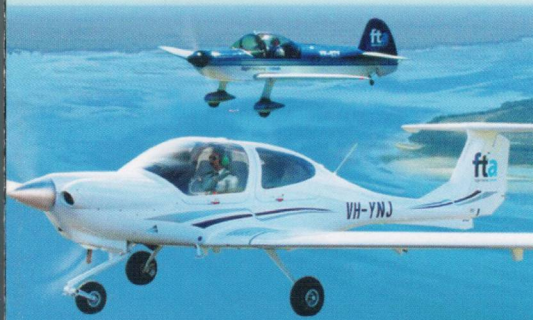
FTI DA-40 aircraft (front)

Boeing Pilot and Technician Outlook 2023 - 2042