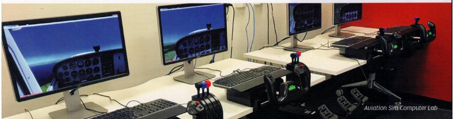
Aviation Sim Computer Lab

Study courses customised to the aviation industry