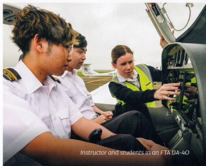
Instructor and students in an FTA DA-40