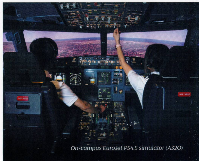
On-campus EuroJet PS4.5 simulator (A320)