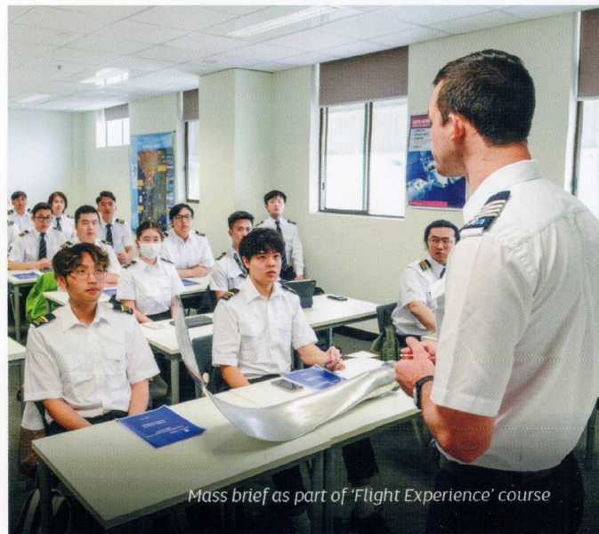
Mass brief as part of 'Flight Experience' course

parafieldairport.com.au/aviation/training